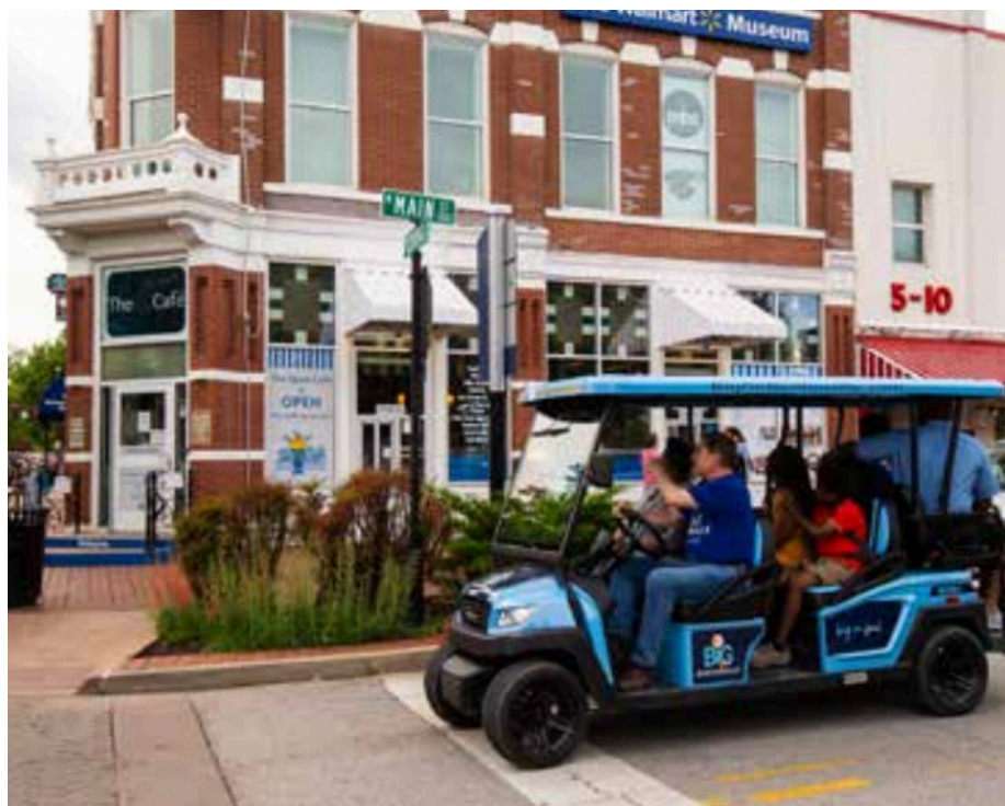
Golf cart tour of Bentonville

The sensational 21c Museum Hotel features 12,000 square feet of combined exhibition and event space to showcase its own collection of contemporary art. In addition to the stylish, contemporary rooms and a superb restaurant, the art is the defining element.