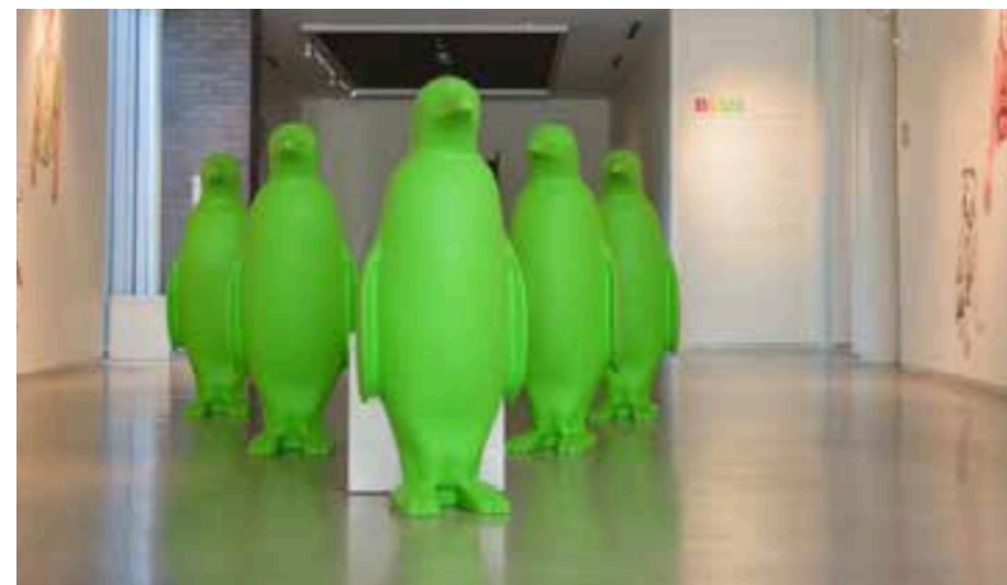
21c Museum Hotel

Afternoon: We kick-off our adventure with a golf cart tour of Bentonville to learn about the city's unique history, see the city's landmarks and incredible public art, talk real estate and reality tv shows and discover wh Bentonville is one of the country's fastest-growing cities. Our tour includes a stop at the original Walton's 5 & 10, home to the history of Walmart in the form of a museum and a stop at The Momentary, a satellite location of Crystal Bridges Museum focused on performance art, contemporary art and community.