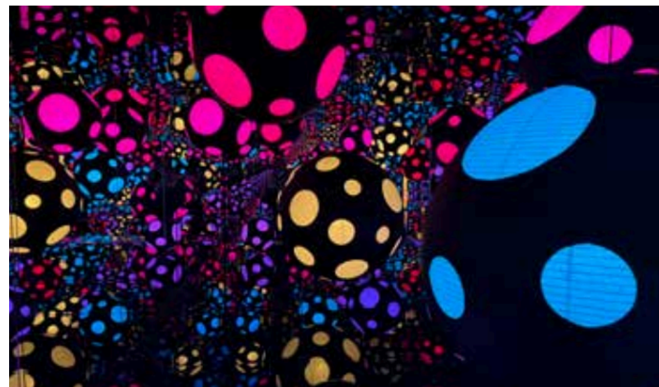
Kusama's Infinity Mirror Room