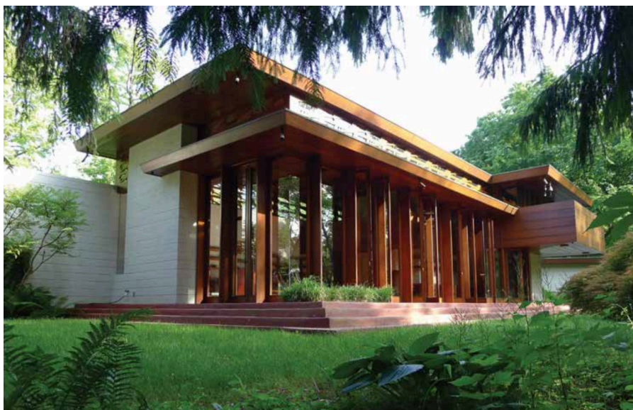
Frank Lloyd Wright's Bachman-Wilson House

Morning: Optional independent visit to the Skyspace . Located on the scenic hillside where the Art Trail meets the City of Bentonville's Crystal Bridges Trail, The Way of Color, Skyspace is a naked-eye viewing chamber that activates a light show of color each day at sunrise and sunset.