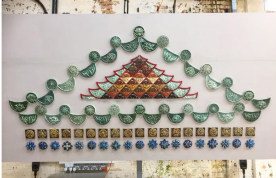
Pavilion by Kay Aplin, Pildong Ceramic Studio