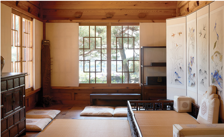
Korea Furniture Museum

The museum is currently closed for renovation, but we hope it will have reopened by October 2026.