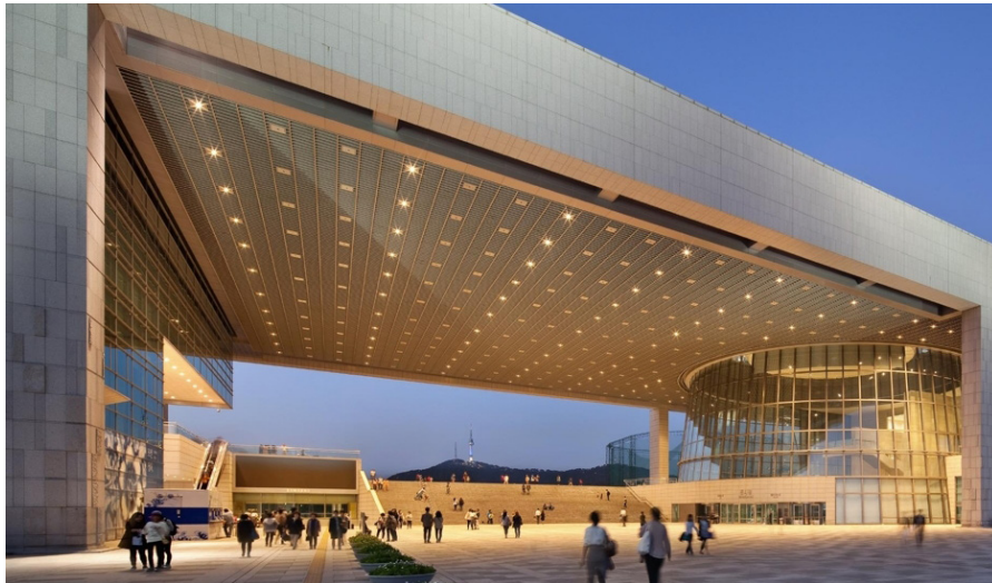
National Museum of Korea