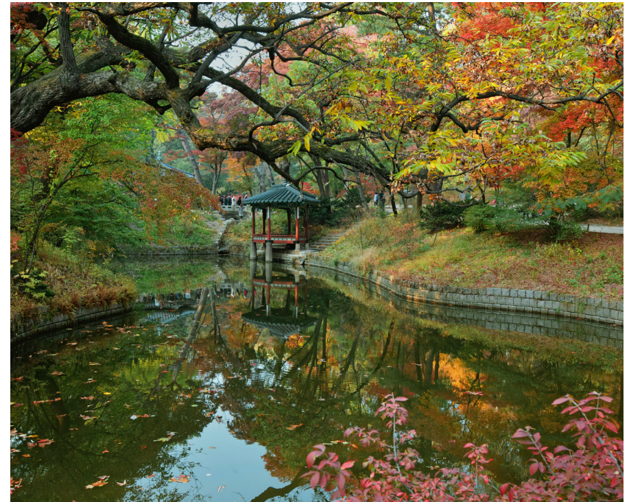
Huwon Secret Garden

For our first night in Seoul, we will enjoy a welcome dinner at hotel's Korean restaurant, Mugunghwa , where the chef's refined take on classic Korean cuisine is paired with views across the city.