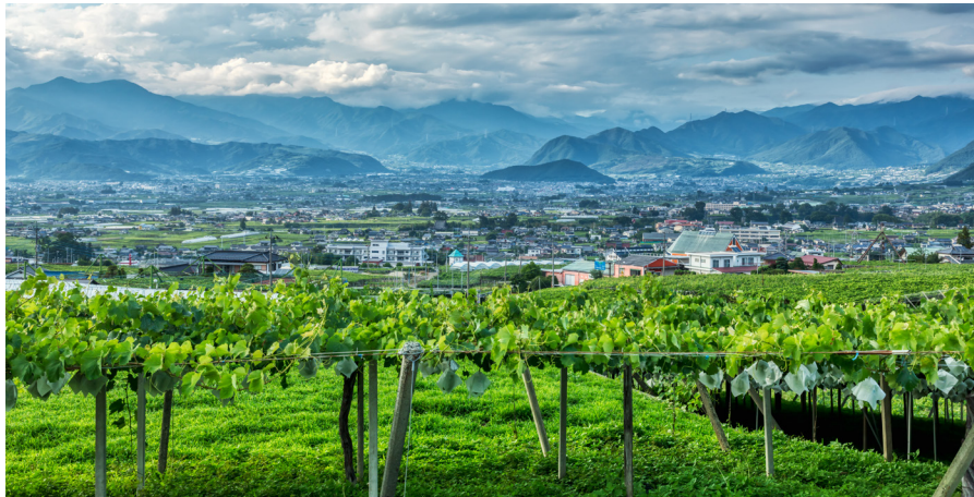
Mountains and vineyards, Gwangju