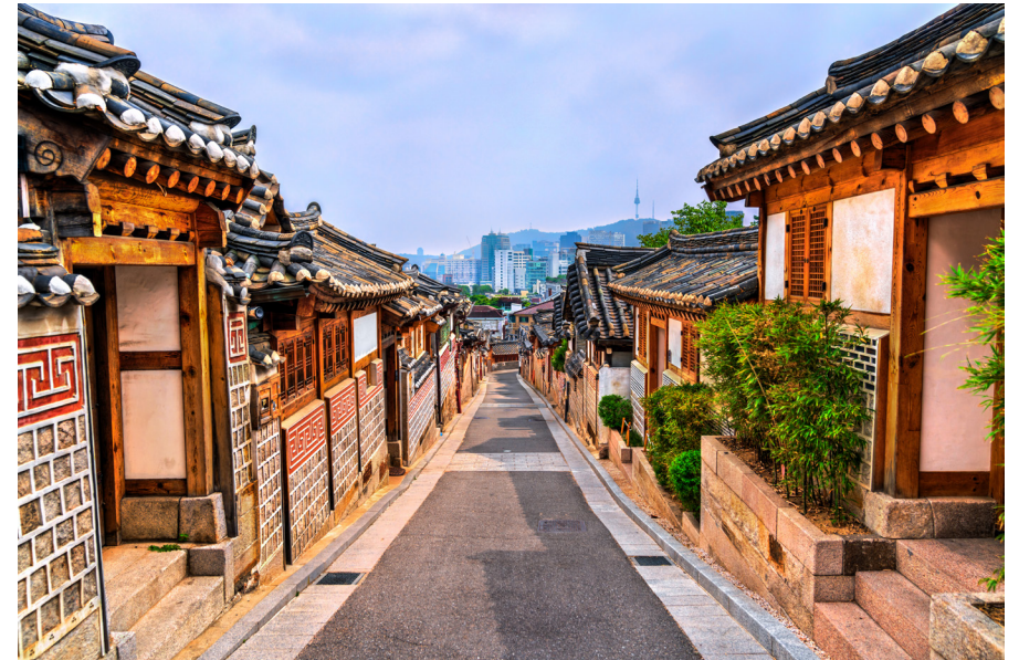
Bukchon Hanok Village