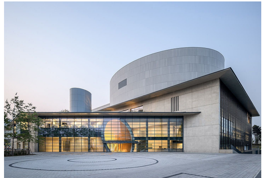
LG Arts Centre

We transfer to the airport for individual departures, arriving at around 5.00pm.