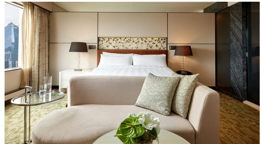
Deluxe Room, Lotte Hotel Seoul

Check into Lotte Hotel Seoul , an elegant and timeless five-star hotel centrally located in Seoul's vibrant Jung-gu district. The shopping streets of Myeong-dong are a short walk away, as are many of the city's excellent restaurants. There is a fitness centre and spa, including an indoor pool, and has multiple restaurants serving a variety of cuisines. The decor blends classic luxury is blended with contemporary sophistication, and service is excellent.