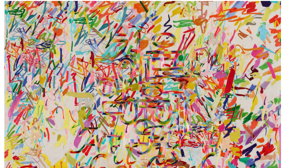
Ham Kyungah, 'Needling Whisper, Needle Country/ SMS Series in Camouflage', 2015 (detail)